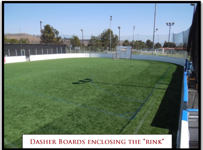
DASHER BOARDS ENCLOSING THE "RINK"