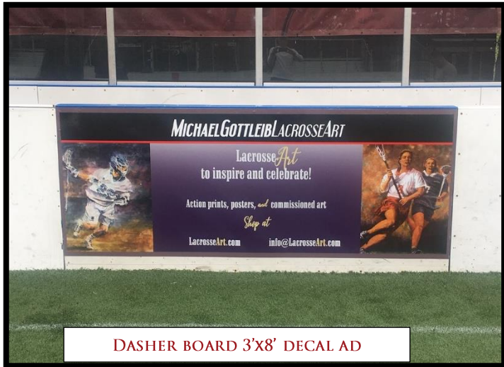
DASHER BOARD 3'X8' DECAL AD