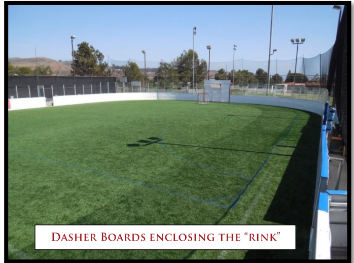
DASHER BOARDS ENCLOSING THE "RINK"