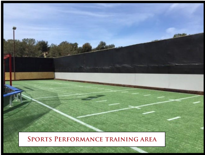
SPORTS PERFORMANCE TRAINING AREA